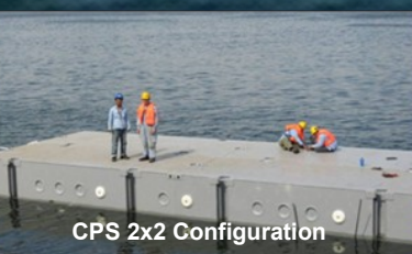
CPS 2x2 Configuration