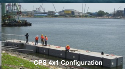
CPS 4x1 Configuration